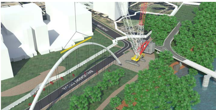
Alfred Street Bridge is an iconic diagonal arch pedestrian bridge supporting eco-friendly city accessibility in Parramatta, New South Wales, Australia.