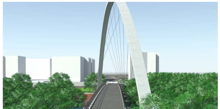
SYNCHRO enabled Solid Support to save 50% in time by generating an accurate digital representation of the bridge installation for their client.