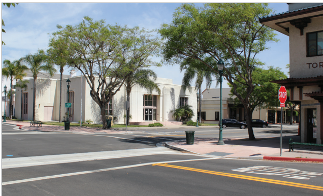
Improvements to pedestrian walkways, ensure safety while maintaining the town’s charm.

The City of Torrance had high standards. Cruikshank says, “The project manager was very particular about the way under-walk drains, driveways, ramps, utility vaults, alley aprons, door entryways and trees were shown on the plans. MicroStation allowed our engineering team to use precise line work, hatching, and text callouts to make the plans easy to read and follow.”